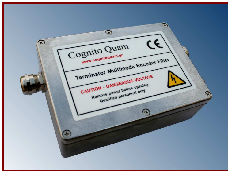
Terminator Multimode Filter in Cast Al IP65 Enclosure

The filters remove all types of electrical noise (common and differential mode, dV/dt transients, ground loop generated etc.) in the encoder signal lines as well as the corrupting effects of mechanical noise and vibration (phantom movement, dither etc.).