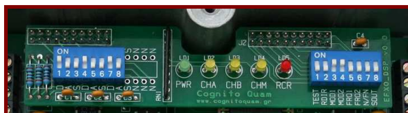
Detail showing the function DIP switches and status LEDs.