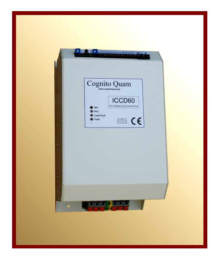
ICCD60 Integral Cycle Control Drive

The ICCDxx line employs thyristor switches to drive thermal loads with complete cycles minimizing supply and load line disturbances and noise.