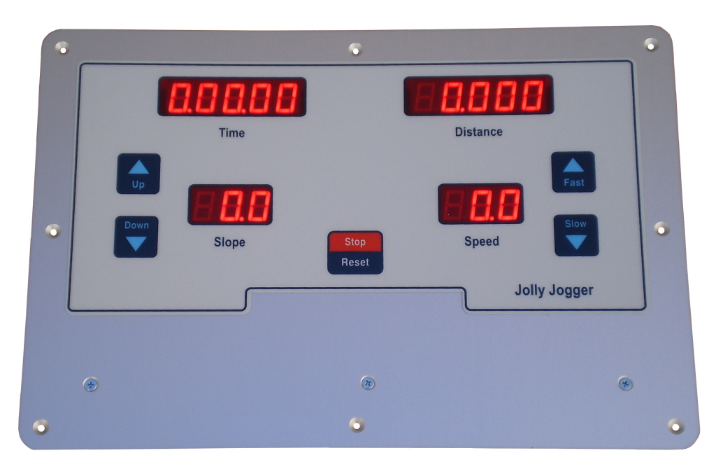
Jolly Jogger Treadmill Controller

Our Jolly Jogger control offers a simple, versatile and comprehensive solution in treadmill applications and is an effective, efficient and popular choice for retrofits. The only external item required to realize a functioning treadmill is the variable speed AC or DC drive with the Jolly Jogger monitoring and controlling all treadmill activity in a safe and vitalizing experience.